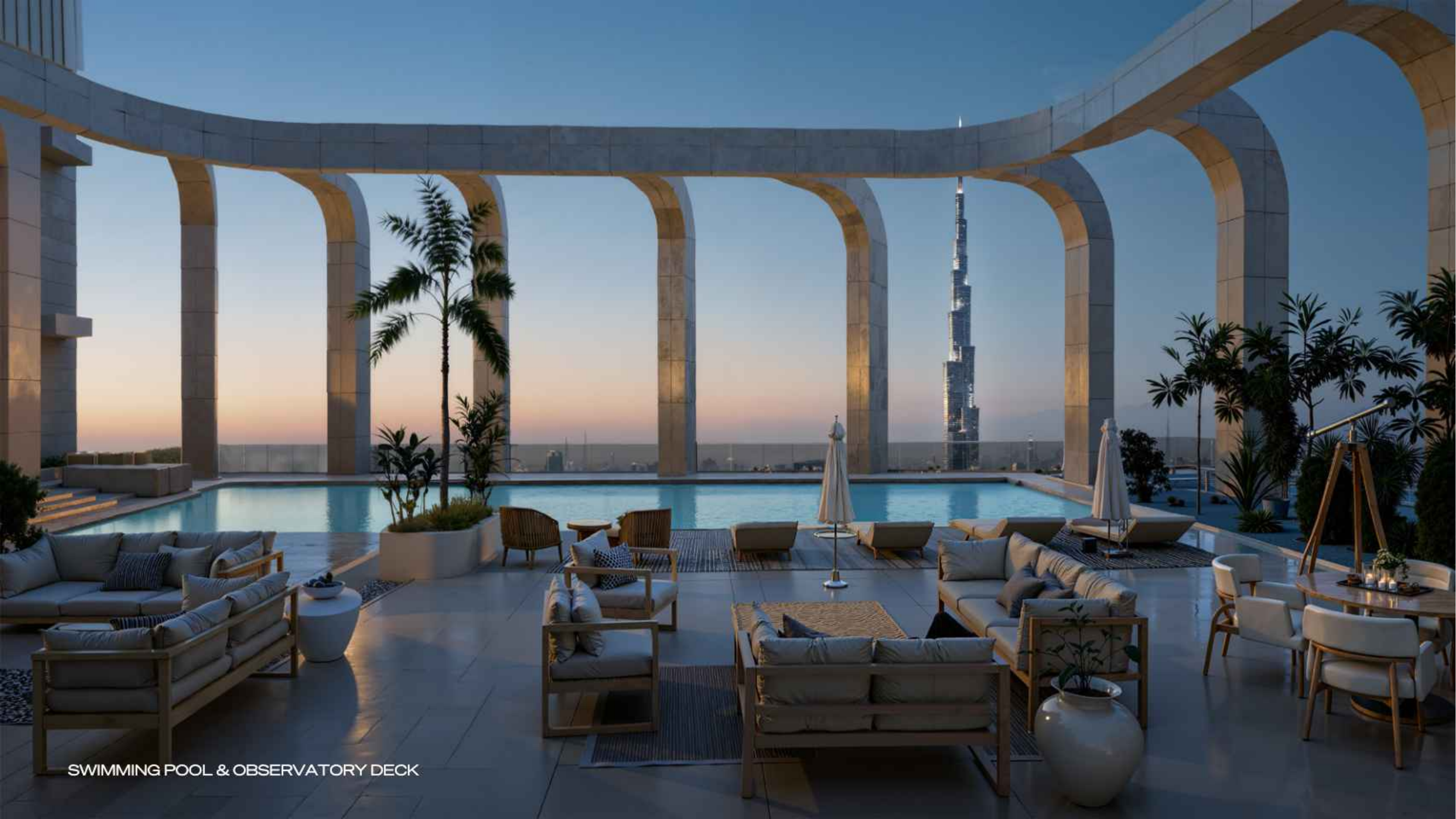
SWIMMING POOL & OBSERVATORY DECK