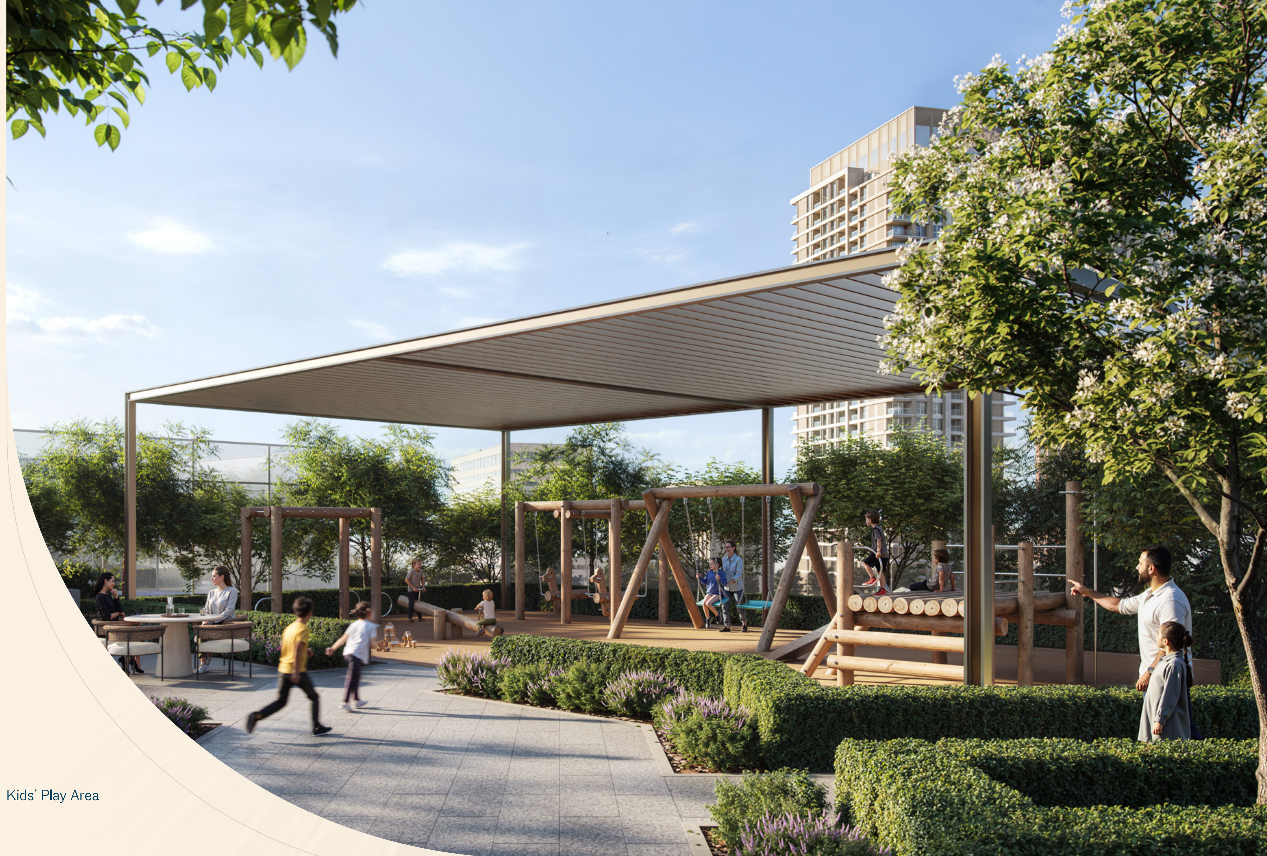
Kids' Play Area