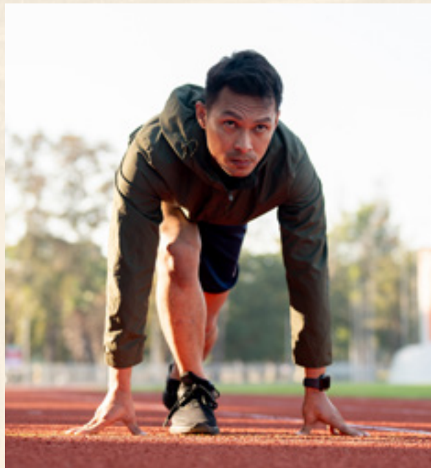
Running & Cycling Tracks