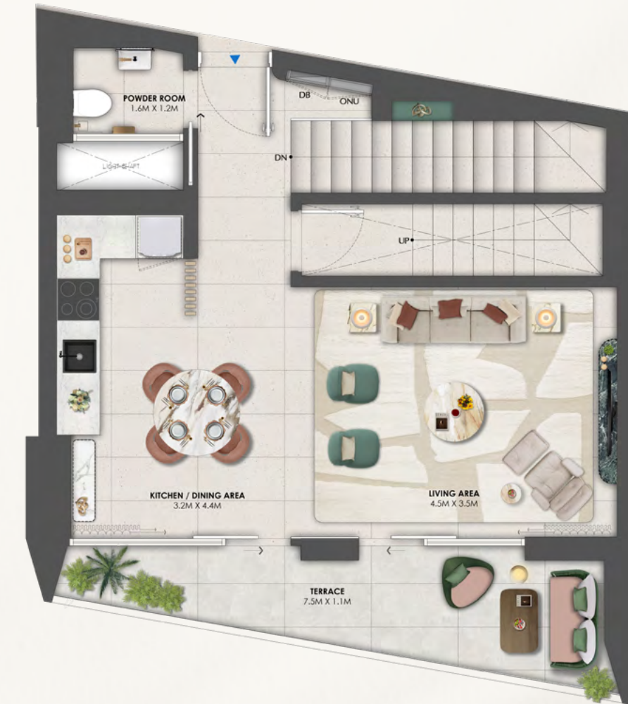
UPPER FLOOR (ENTRY LEVEL)