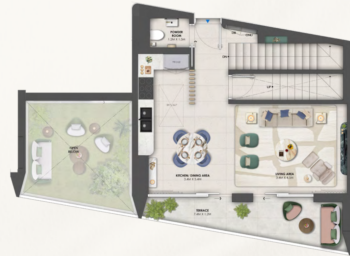
UPPER FLOOR (ENTRY LEVEL)