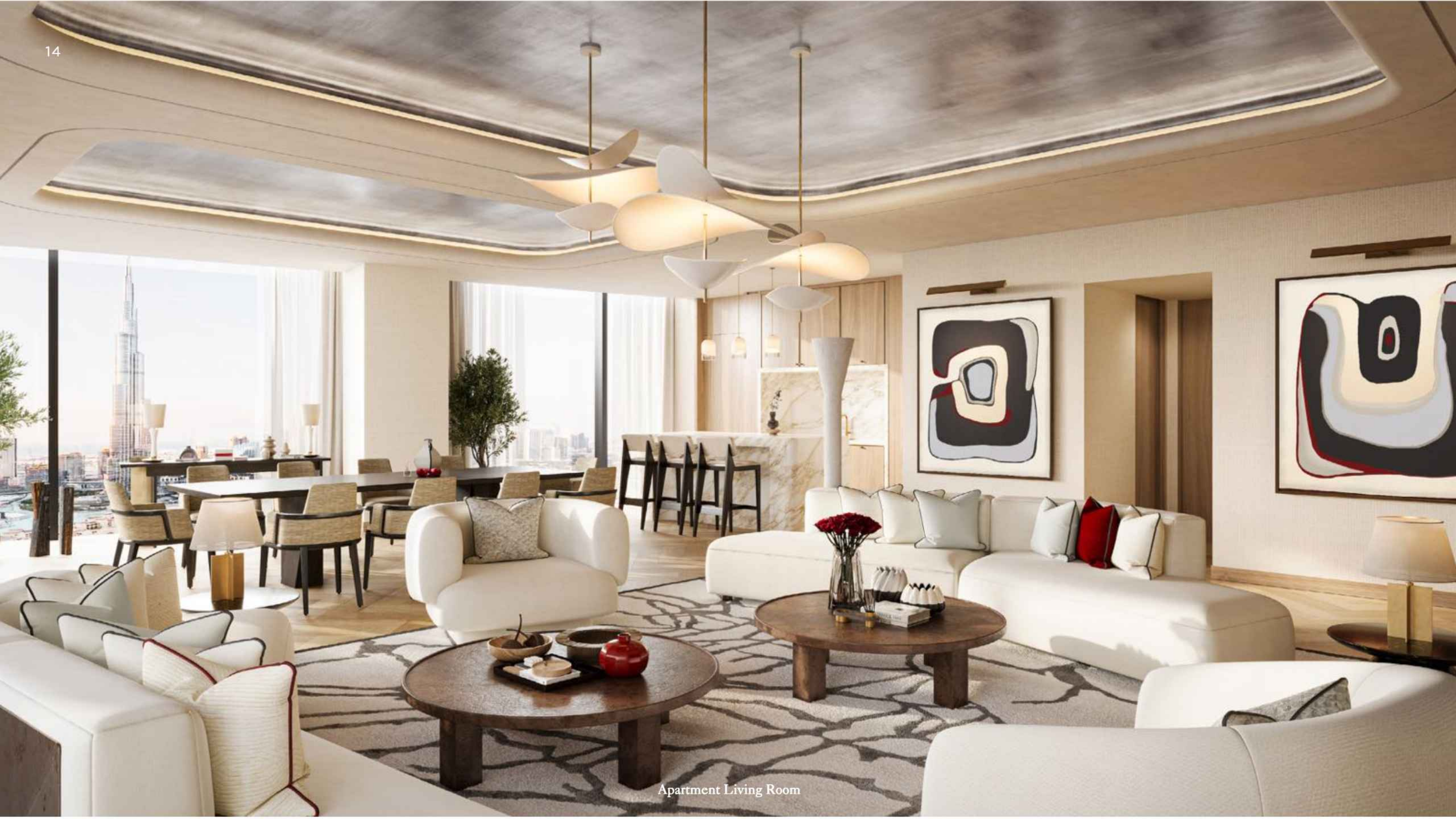
Apartment Living Room