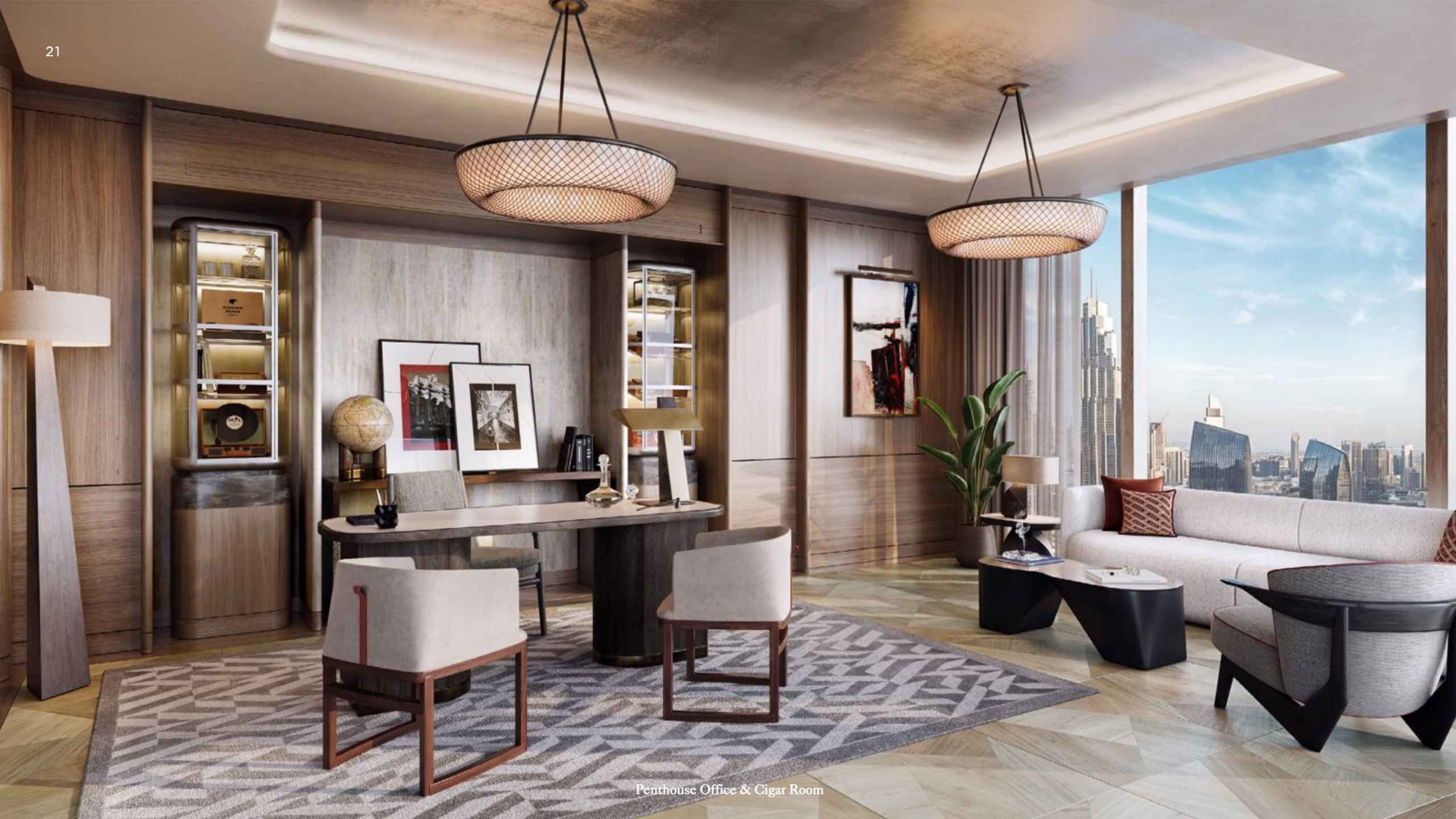
Penthouse Office & Cigar Room