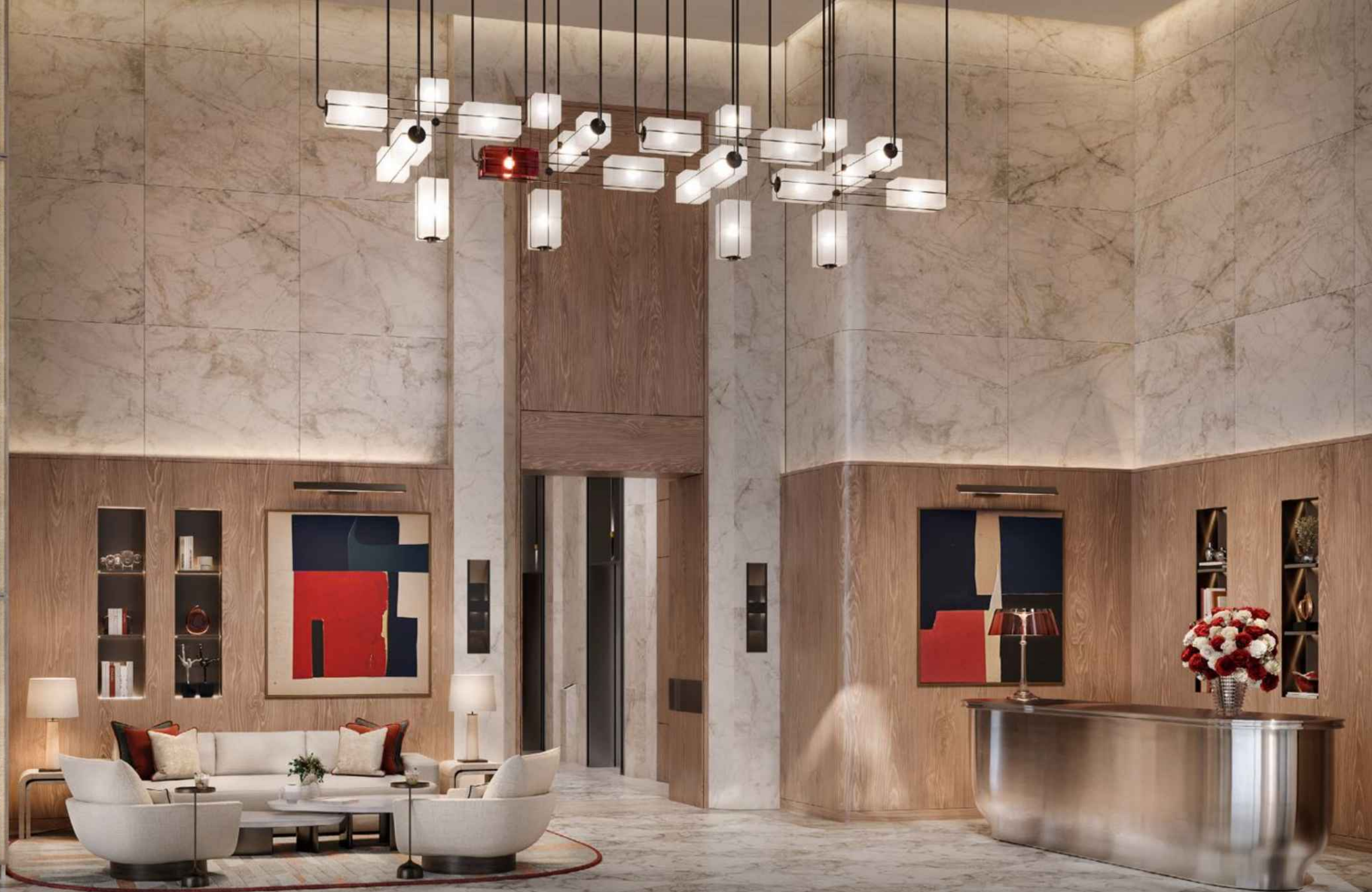
Arrival Lobby & Reception