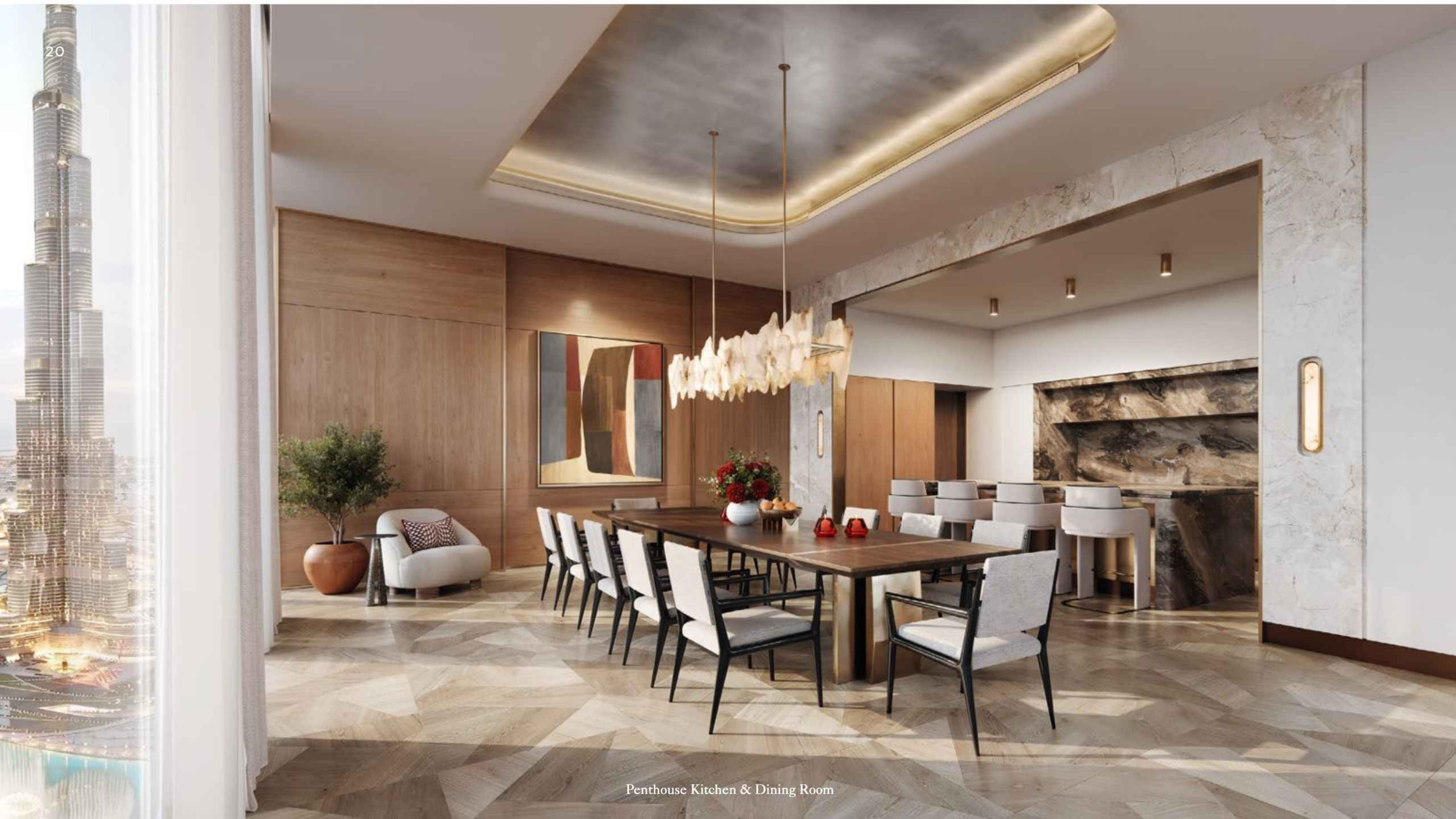
Penthouse Kitchen & Dining Room