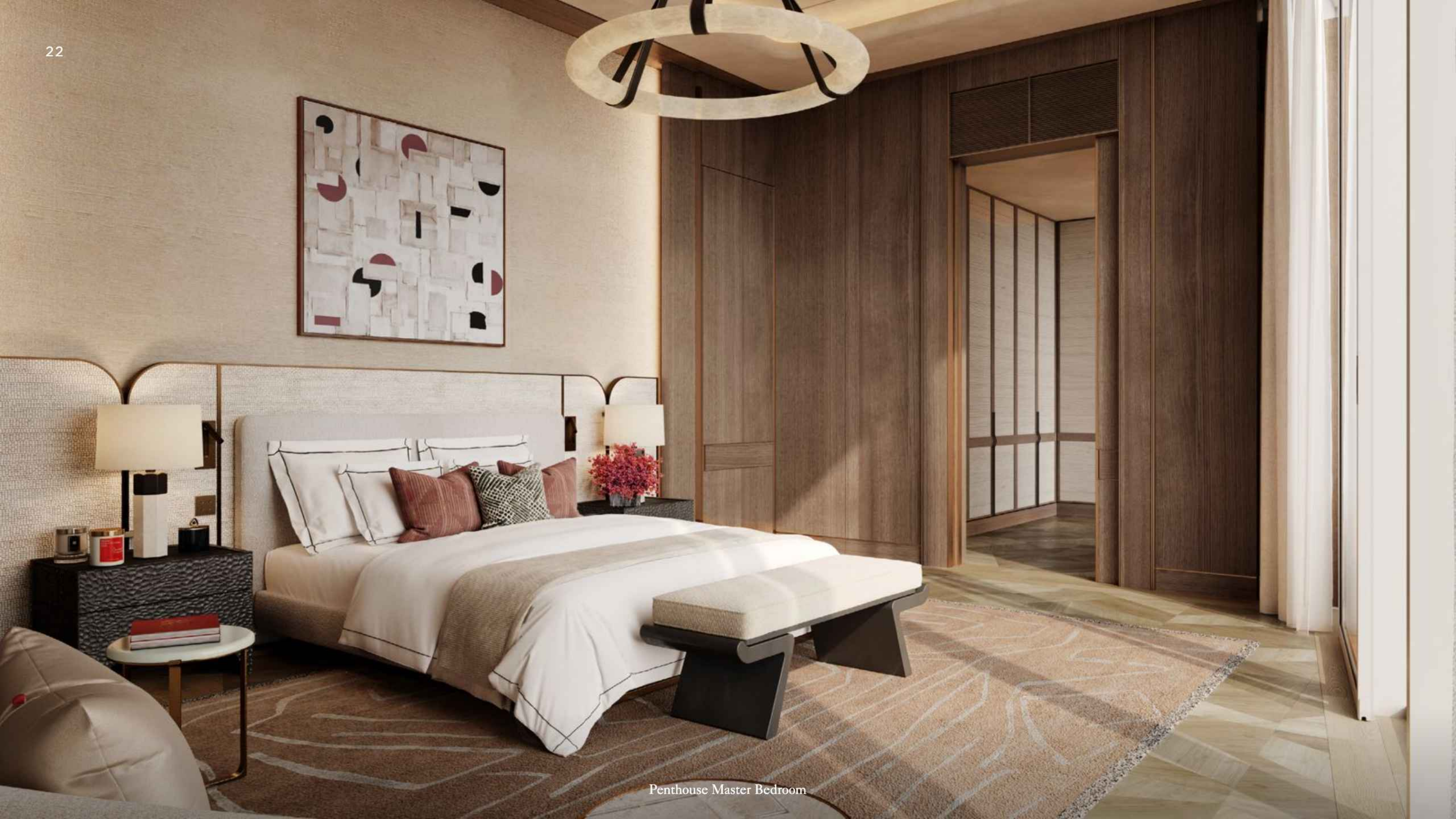
Penthouse Master Bedroom