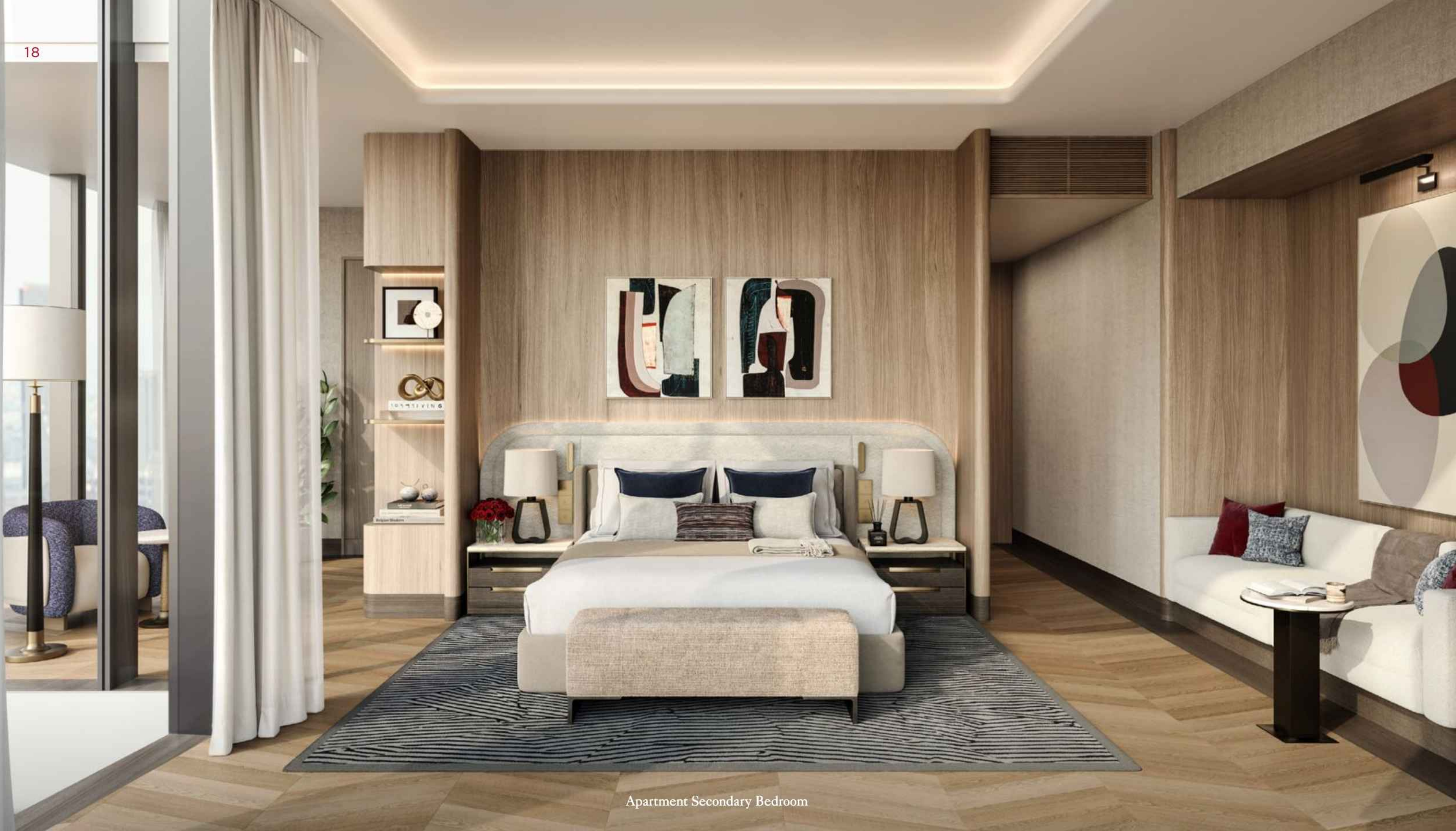
Apartment Secondary Bedroom