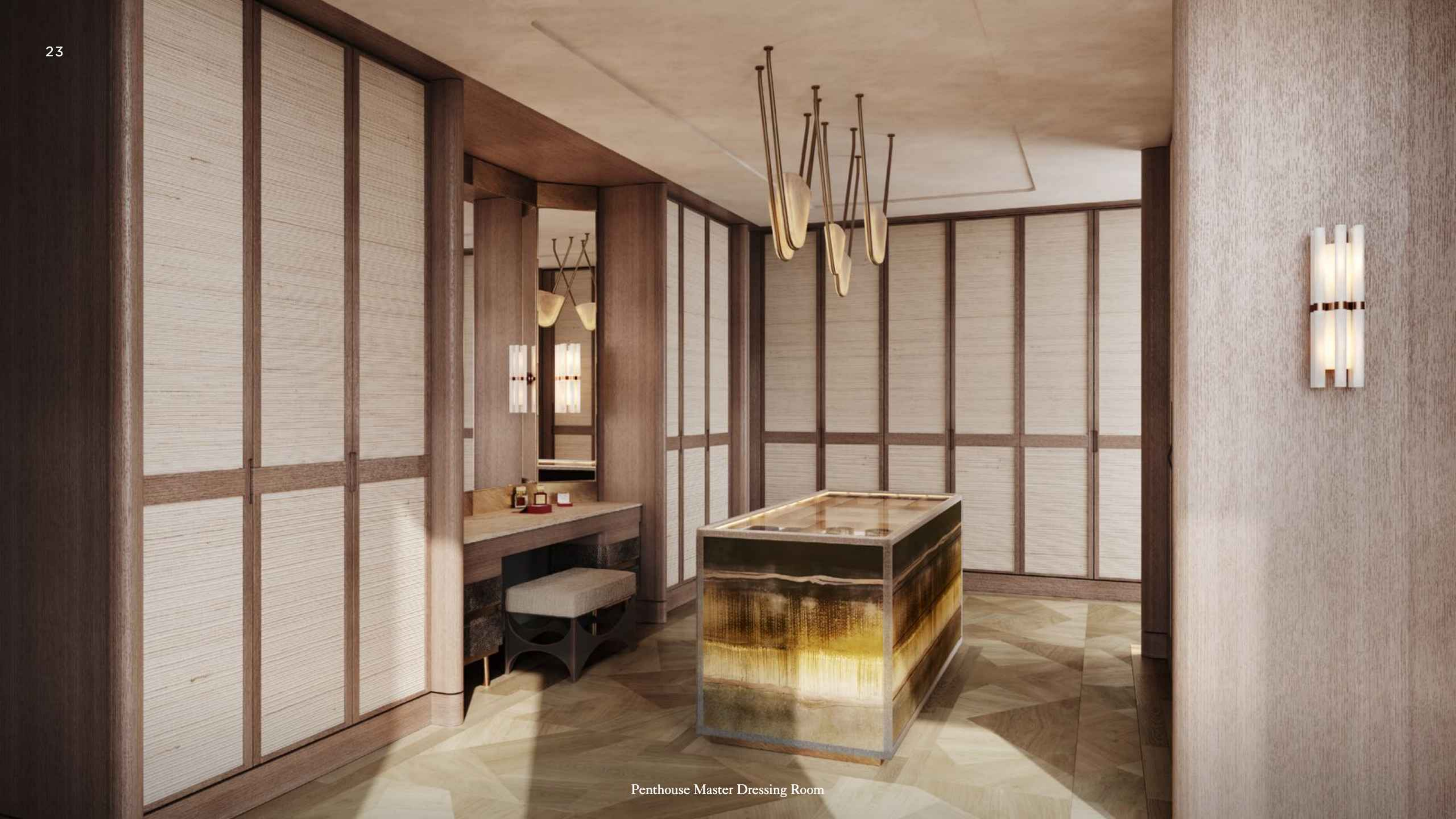
Penthouse Master Dressing Room