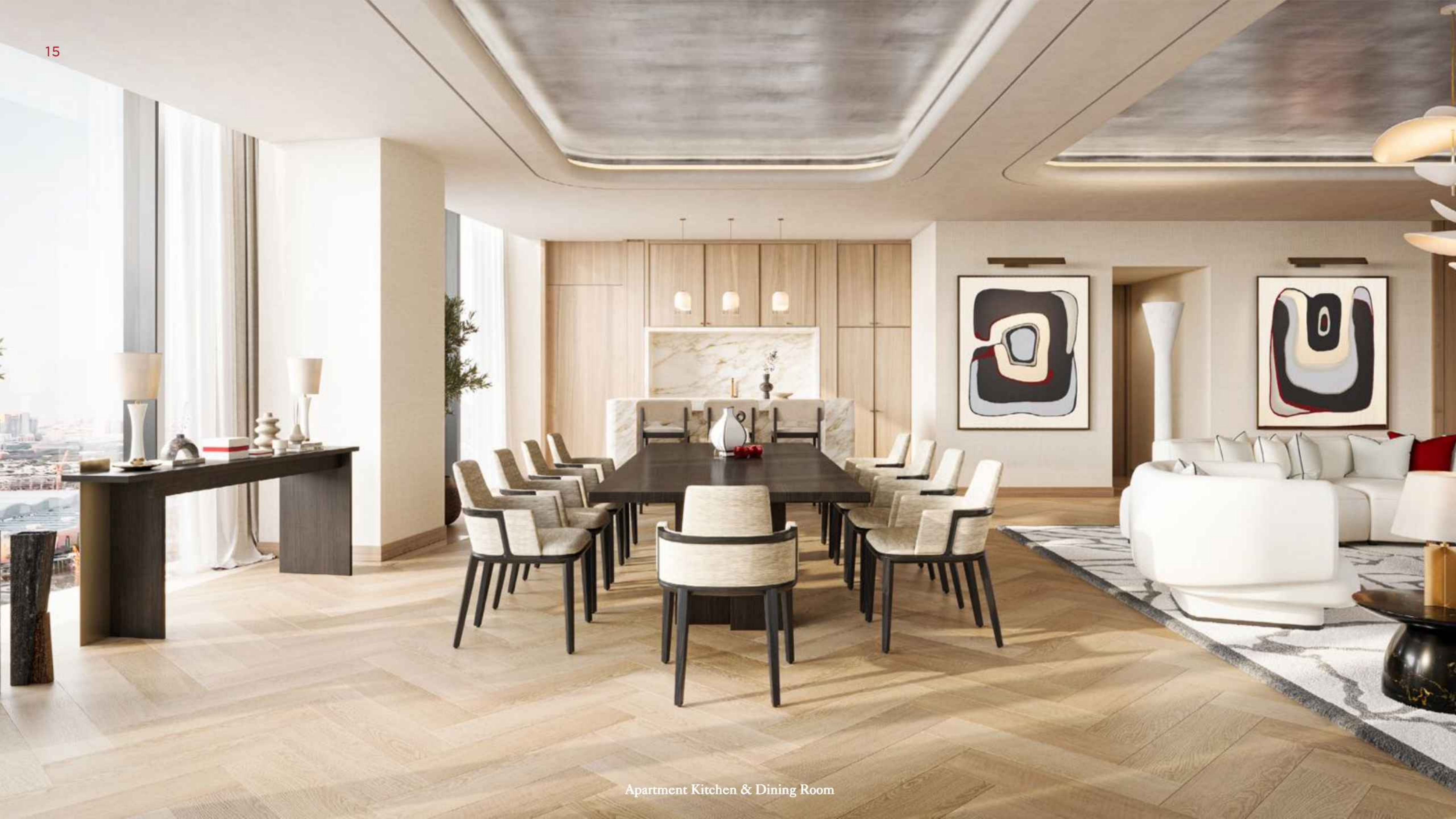
Apartment Kitchen & Dining Room