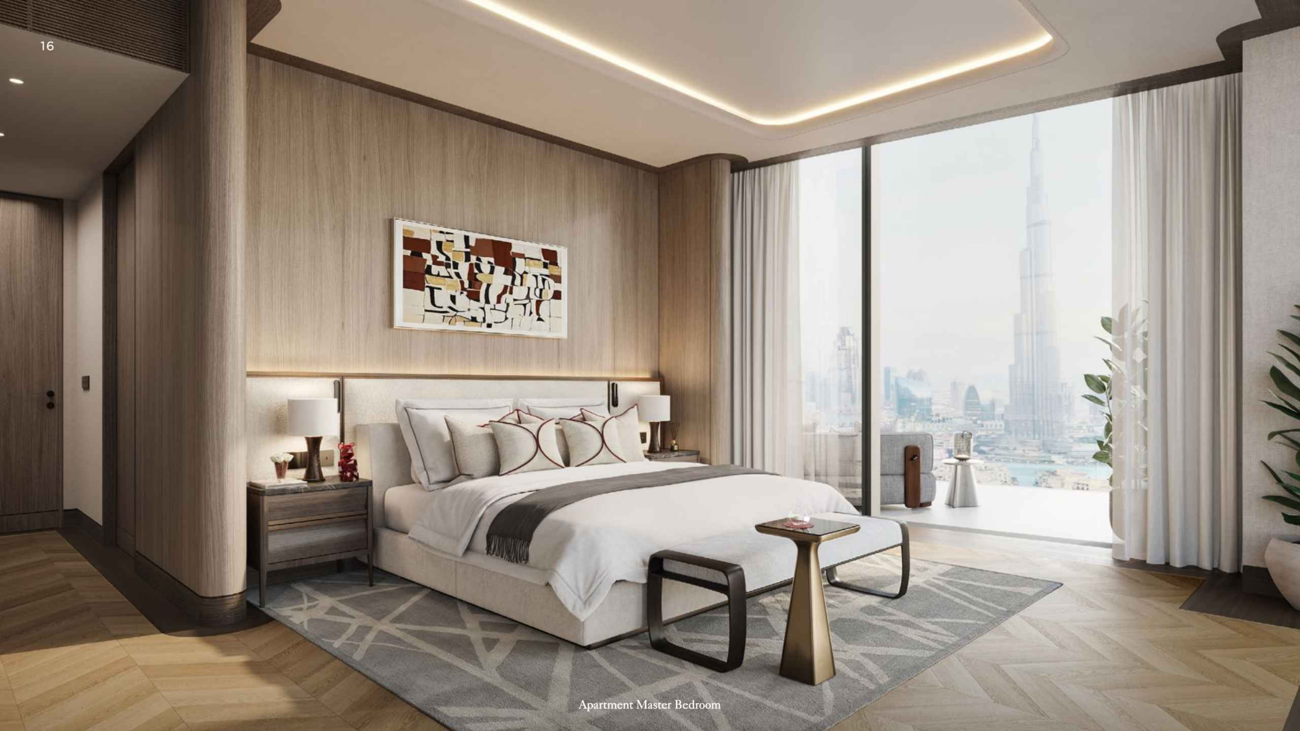
Apartment Master Bedroom