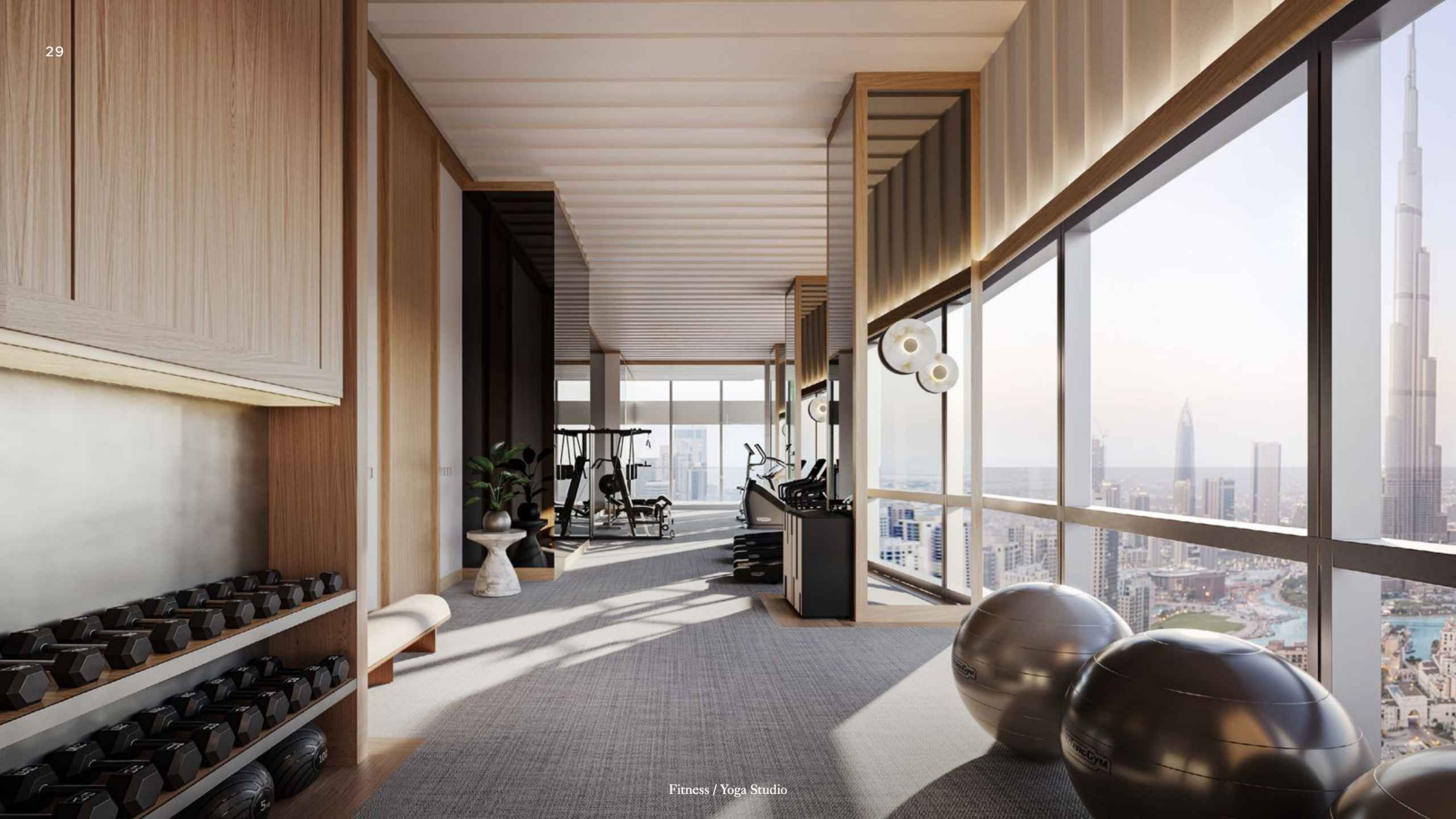
Fitness / Yoga Studio