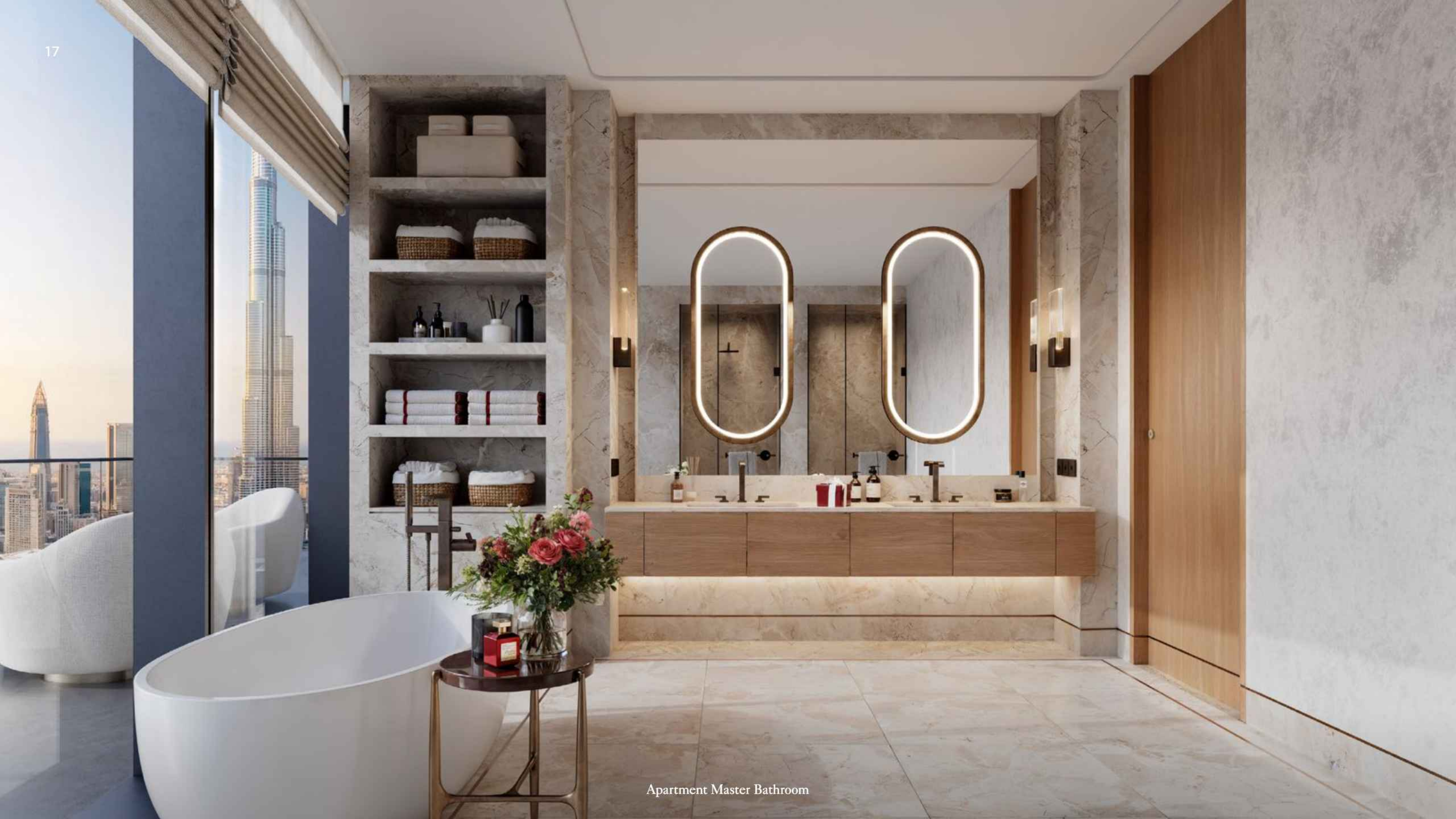
Apartment Master Bathroom