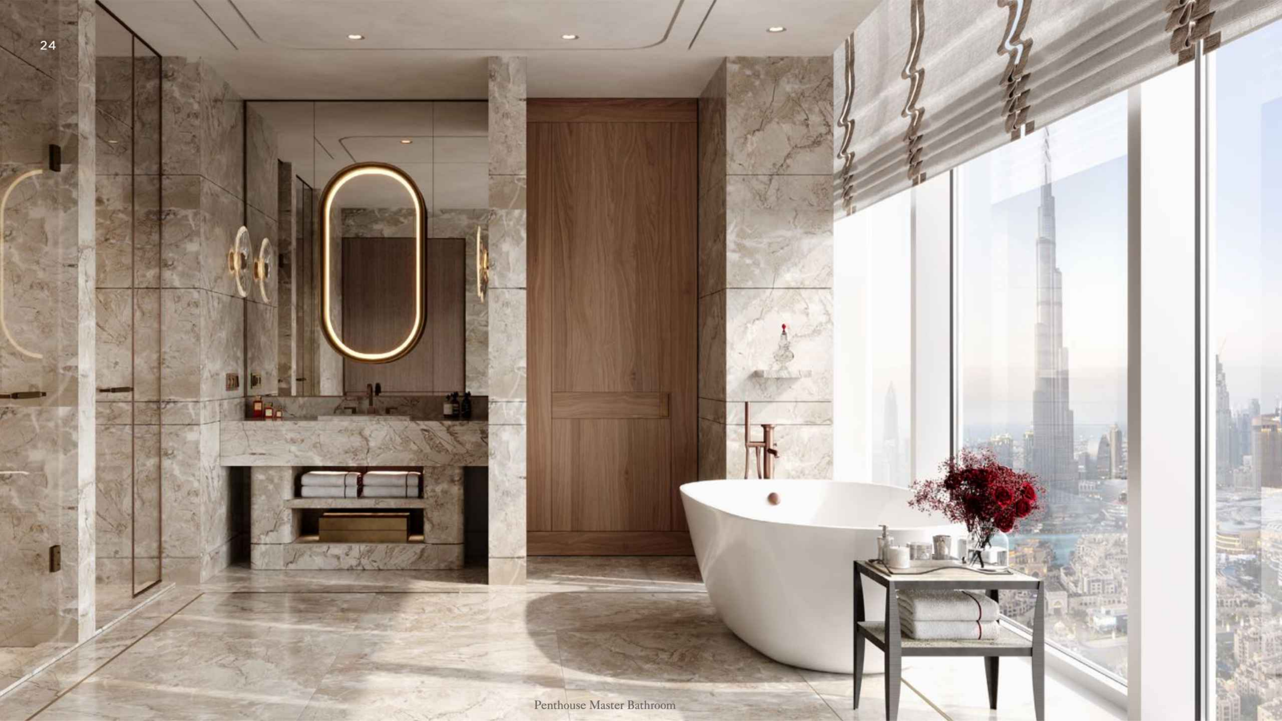
Penthouse Master Bathroom