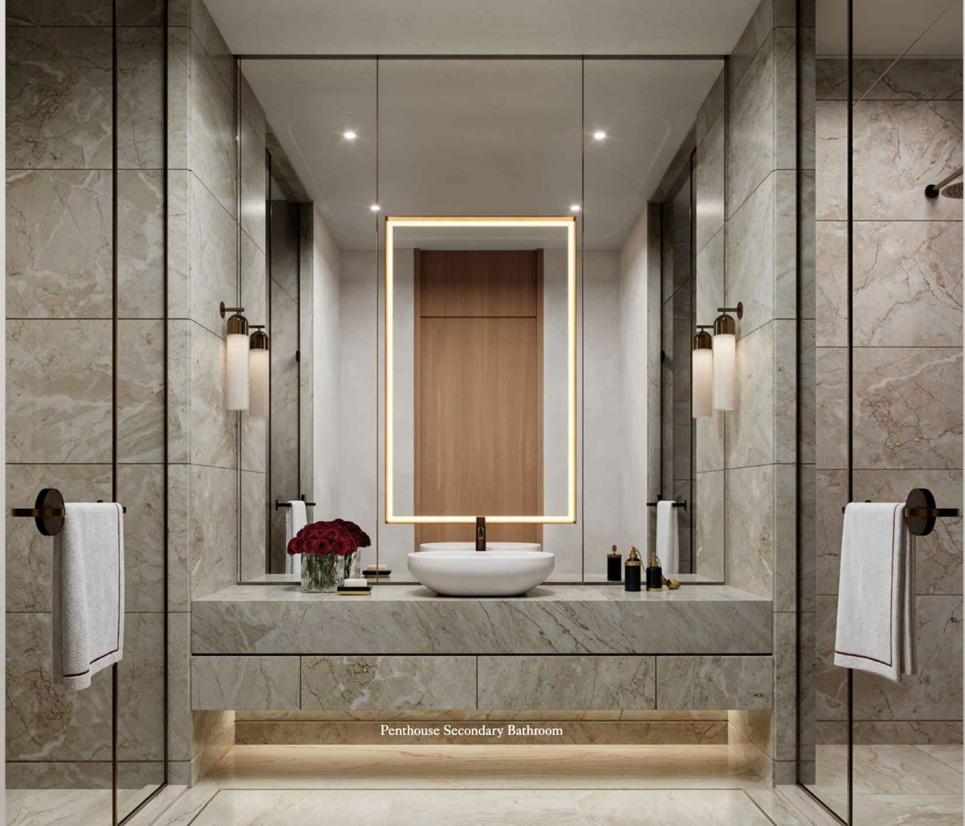
Penthouse Secondary Bathroom