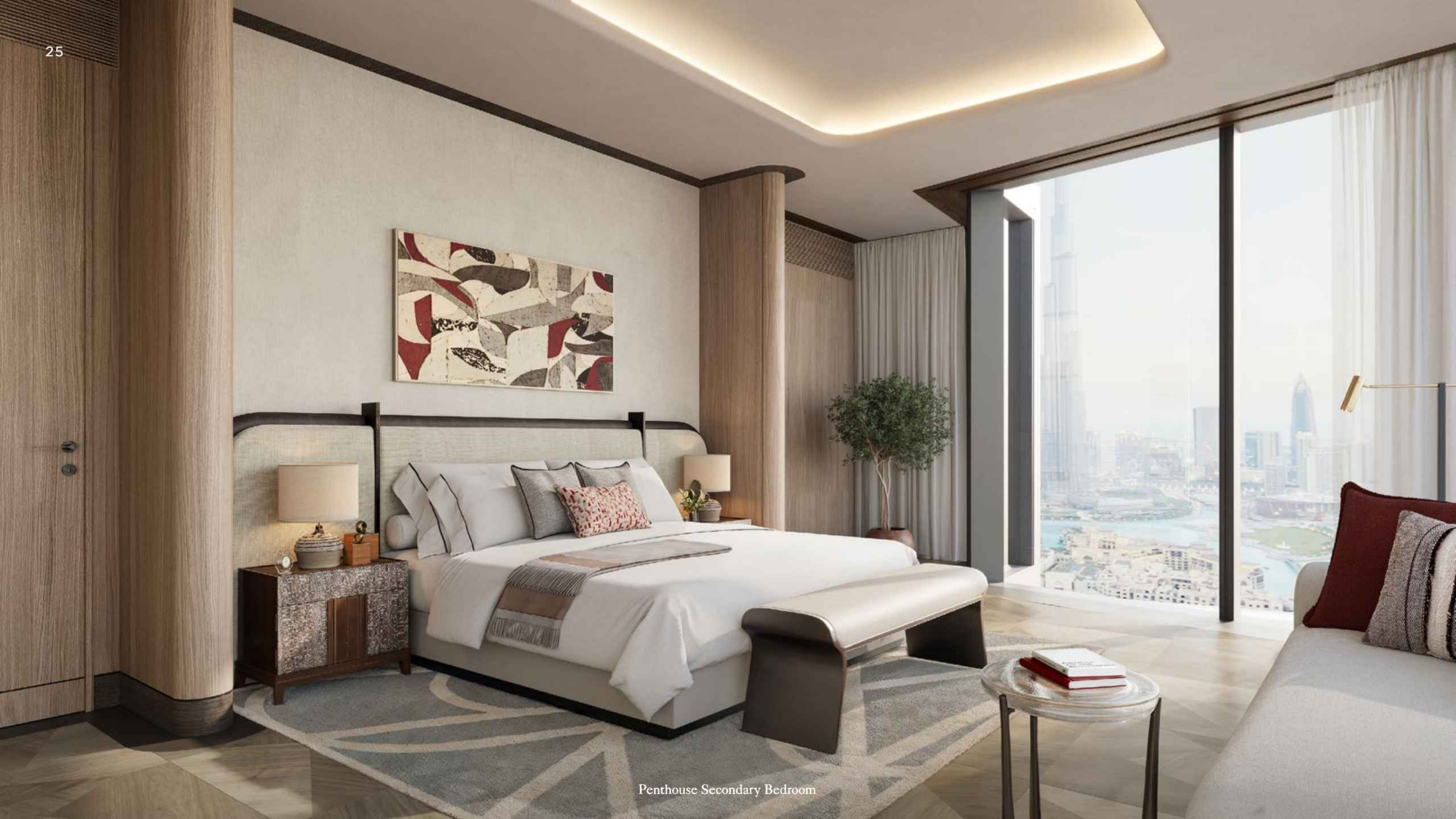
Penthouse Secondary Bedroom