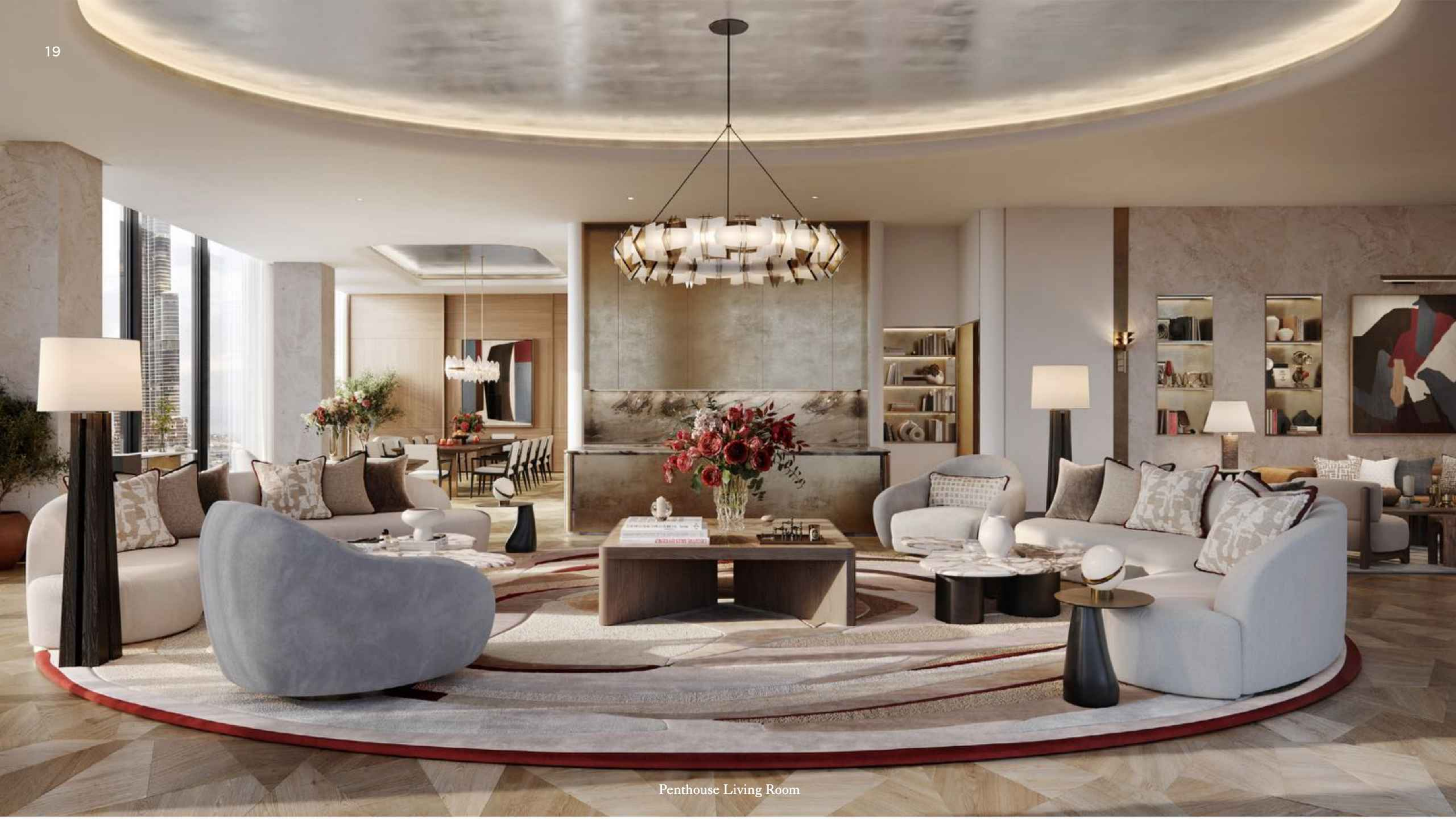
Penthouse Living Room