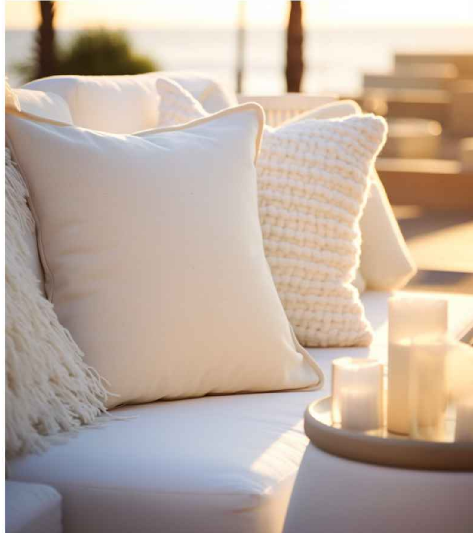
Terraces OVERLOOKING THE BEACH AND PODIUM GARDEN