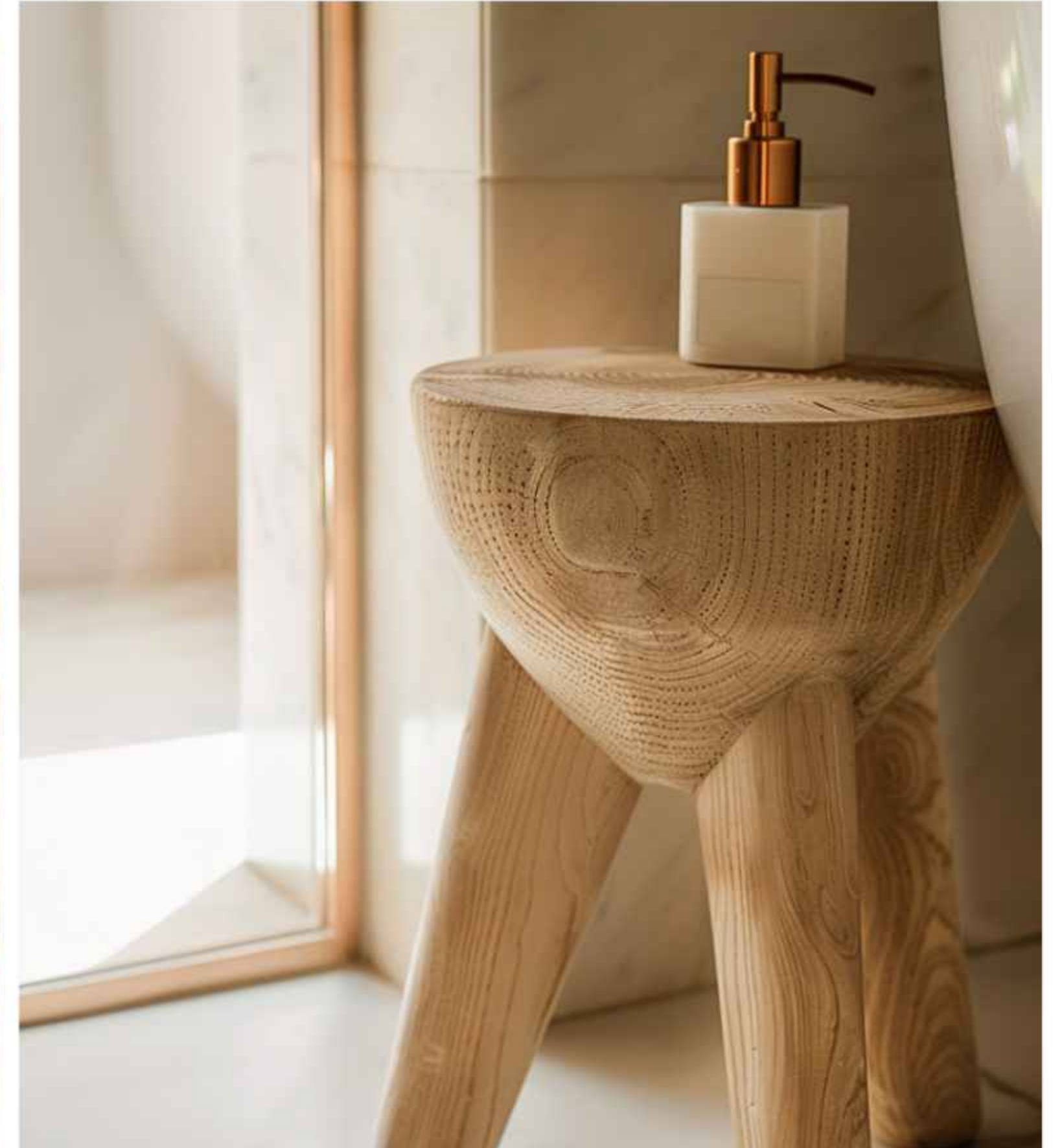
Units CONSIST OF ENSUITE TOILET