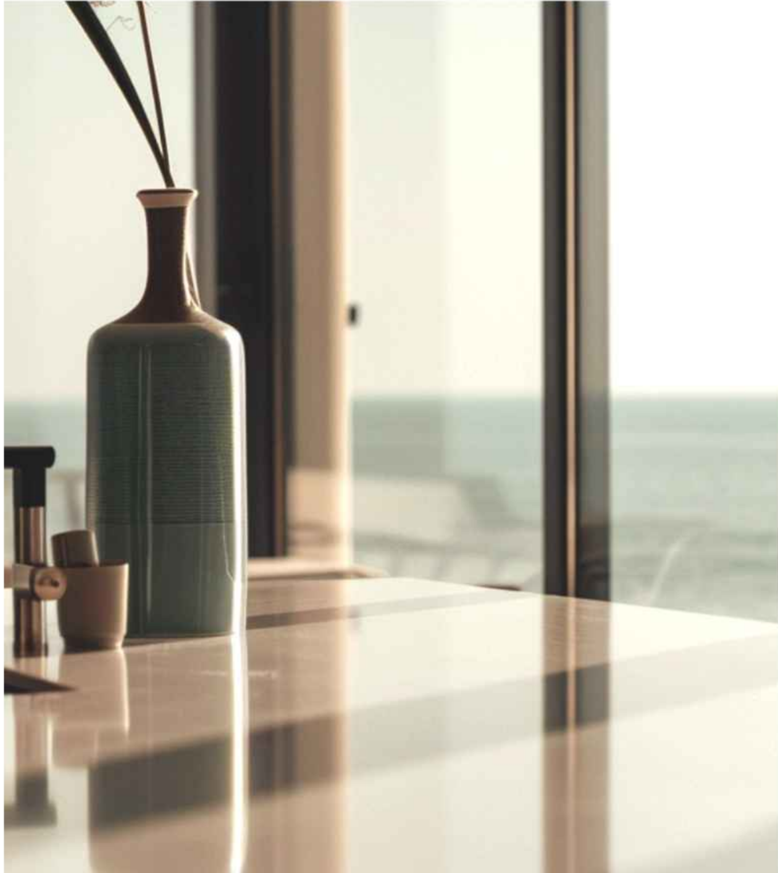
Kitchen WITH BUILT-IN FIXTURES