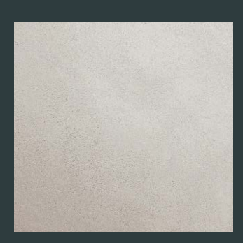
Light Grey Honed Concrete Paint