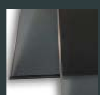
Tinted Black Glass