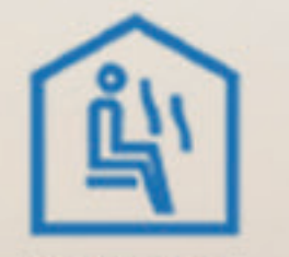
Sauna & Steam Room