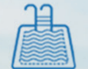
Apartments with Private Pools