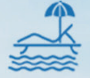
A Luxurious & Large Leisure Pool Deck