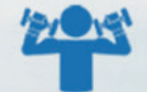
Full Health Club Indoor & Outdoor Gym