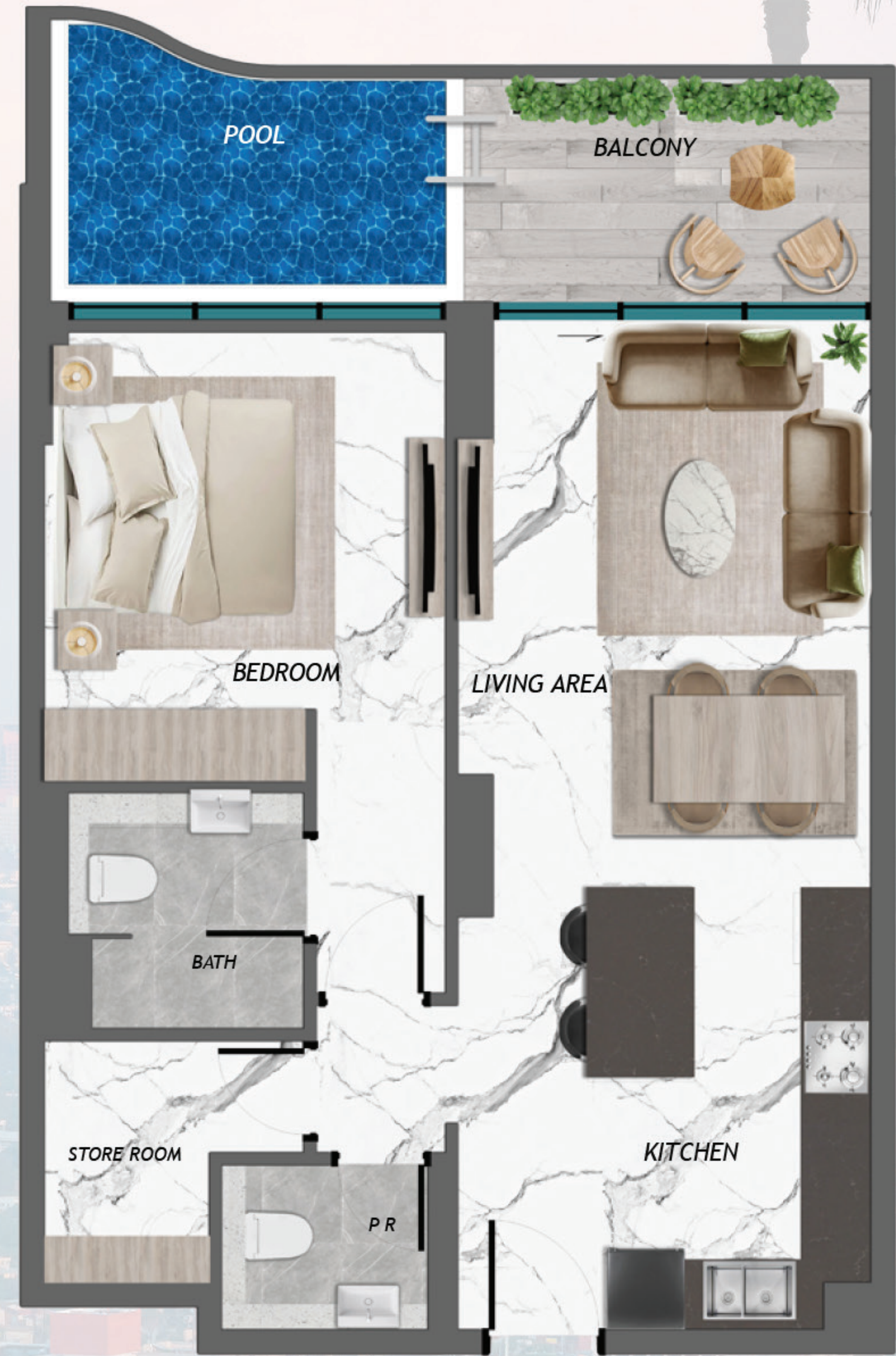
1 BR WITH POOL