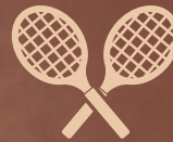
Squash & Tennis Court